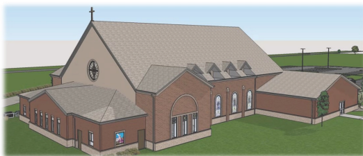
ST. GALL Catholic Church

These Catholic stores have supported the local communities for many years. Both stores provide books, DVD's, CD's and gifts for children and adults. The Catholic Corner hosts special events as well. Confirmation is this February. What better places to purchase that special Confirmation gift!