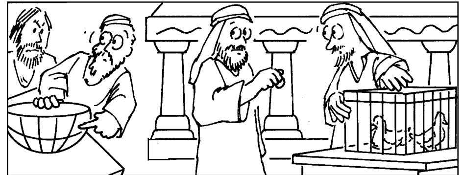
Liturgy of the Word for Children 10:30am Sunday Mass

----- St. Gall Parish, 43W885 Hughes Rd., Elburn Faith Formation Office 630-365-9166